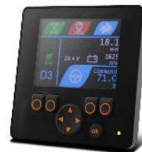
New SD-DISPLAY-CR0451 P/N B56556X