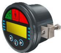
Display P/N A47449A

Poclain Hydraulics improves continuously its product ranges and is replacing its 1,5" and 4,3" electronic display.