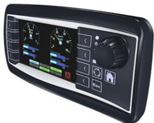
Display P/N A48371C