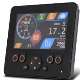
New SD-DISPLAY-CR0452 P/N B50721F